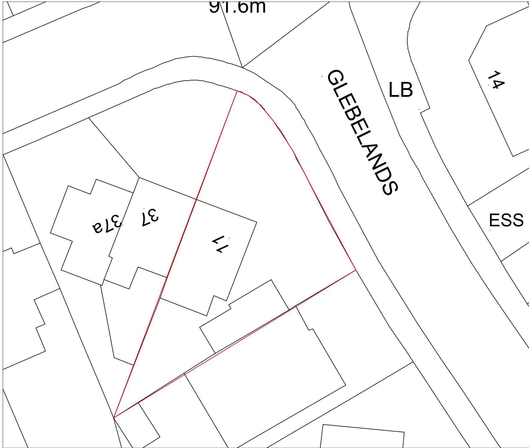
1 EXISTING BLOCK PLAN SCALE- 1:1200