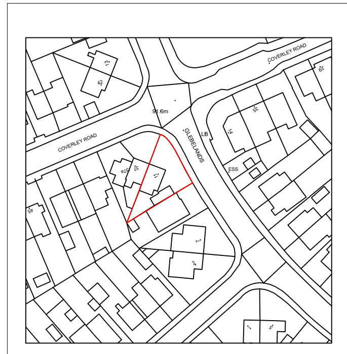
1 LOCATION PLAN SCALE- 1:1250