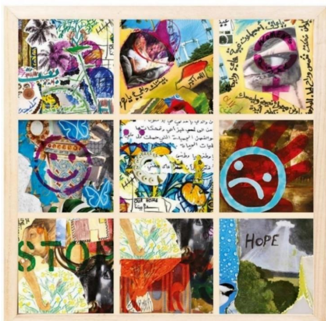
Windows painting created by the residents of local asylum hotels, hosted by the Museum of Oxford and displayed at Oxford Town Hall for Refugee Week, 2024

Our vision for Oxford City Council as a local authority of sanctuary is to create a welcoming and safe environment where those seeking sanctuary feel supported, accepted, and embraced as part of the broader community. A city where all residents can thrive, contribute, and actively participate in the community, helping to shape the future and enrich the life of Oxford for all.