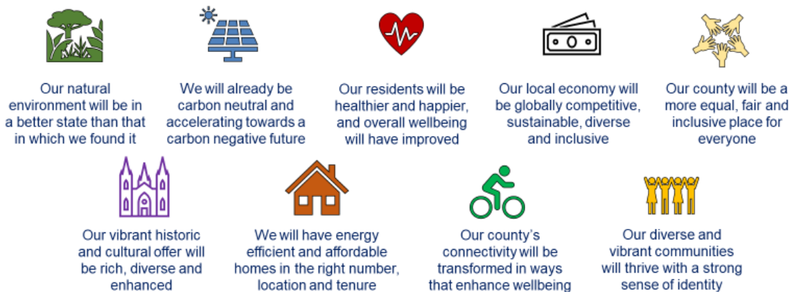
Figure 1: Graphic showing the nine outcomes of the Strategic Vision for Sustainable Development in Oxfordshire.

The Strategic Vision is a non-statutory document. It provides an overarching framework to inform a range of different plans, strategies, and programmes, to drive improvements in environmental, social, and economic well-being and further complements plans and strategies already in place and approved by the FOP and partner organisations.