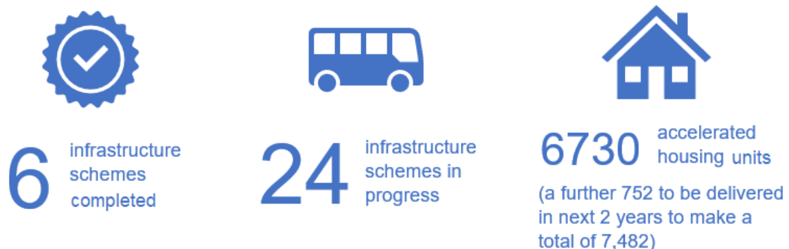
Figure 2: Infrastructure schemes delivered and in progress and associated housing units delivered through the Homes from Infrastructure programme as of 31 March 2023.

Oxfordshire County Council is now accountable for delivery of the remaining programme; a Memorandum of Understanding sets out commitments to positive partnership working, with particular regard to consulting with partners over any proposed changes to the programme of infrastructure delivery.