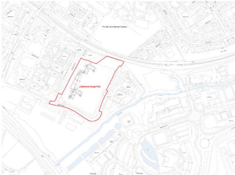
Figure 1: Site location plan