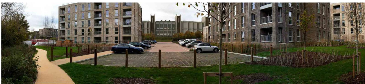
Viewpoint 3: View from Armstrong Road/Littlemore Brook Public Open Space - Photomontage

9.41. Again, the distance between the plots would mitigate the potential for the buildings to have an overbearing impact on neighbours. Further, the transparency of the proposed eastern elevation and intervening landscaping along the eastern and southern boundaries (please see figure 6 below) would soften the outlook for neighbours within Newman Place.