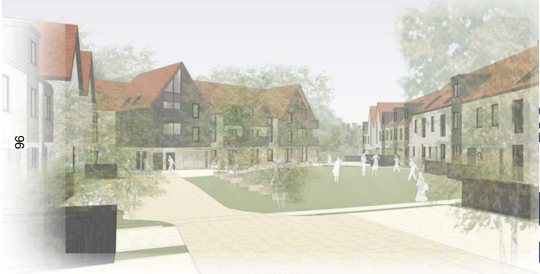
View of Public Open Space