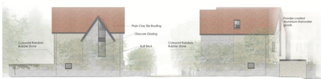
02 Entrance Side Elevation Unit 01 1 : 100