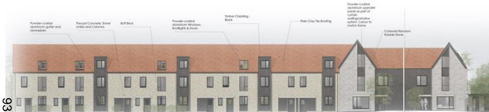
01 Terrace 03 Street Elevation Part A 1 : 100