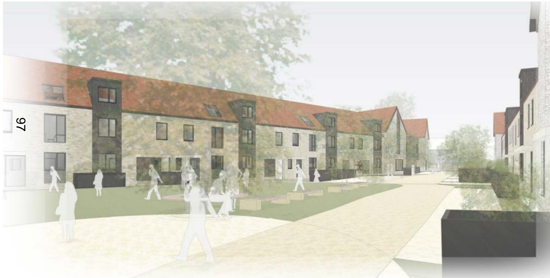
View from courtyard towards Site Entrance