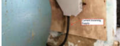
EXISTING INCOMING ELECTRICAL SUPPLY - TO BE MADE REDUNDANT

180mm \phi F&R PRE-INSULATED PIPEWORK ROUTED IN NEW TRENCH FROM CHAMBERS TO BASEMENT PLANT ROOM, ROUTED TO AVOID ROOT PROTECTION ZONES.