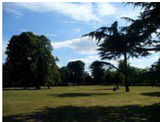
Specimen trees in parkland at Bury Knowle Park

Modern additions to the public parkland include references to Headington's literary heritage and, particularly to C.S. Lewis' children's stories. These include the Storybook Tree, and the surrounding benches, which depict animals that feature in the Chronicles of Narnia, as well as the 'Peace Sculpture' of 12 decorated slabs set in the grass, each provided by one of Headington's schools. The large children's playground, enclosed by a low beech hedge, provides another resource for families with small children in the park.