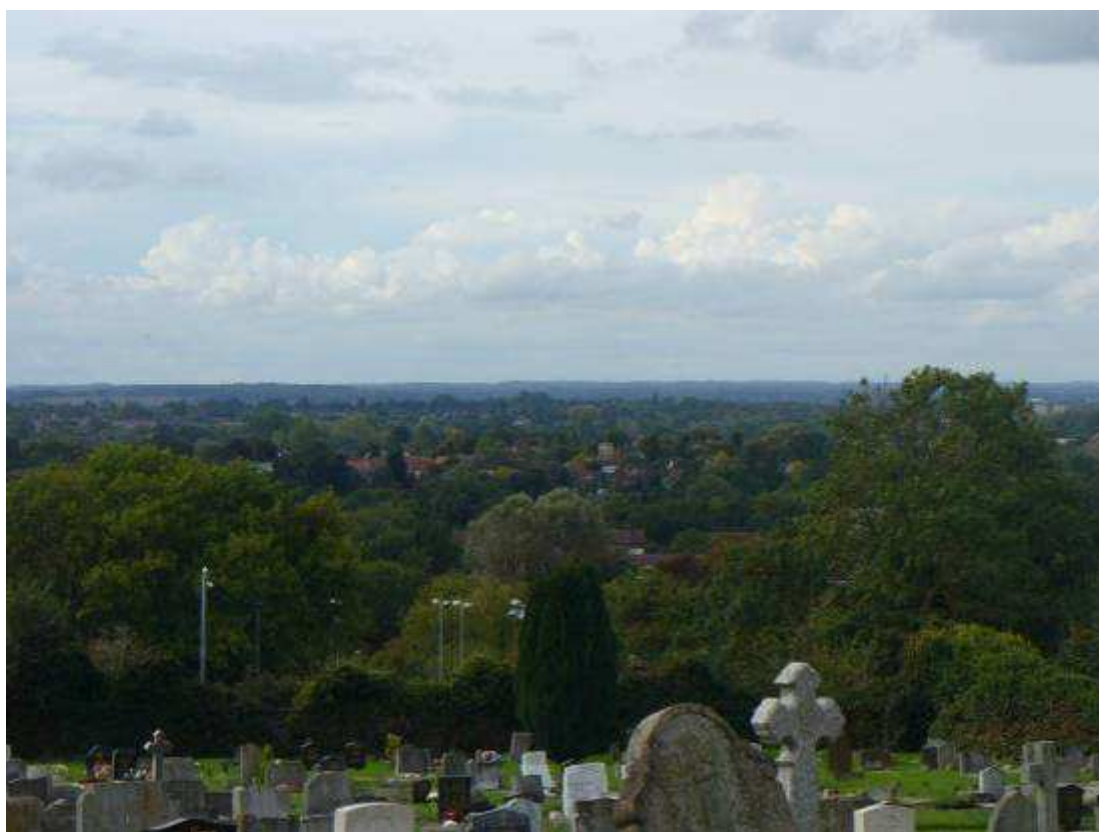
View north west from Headington Cemetery

The buildings are widely varied in their historic origins, materials and styles. They provide a cross section of the village's development history, including the 1960s experimental architecture of Nos. 10-18 Dunstan Road by Ahrends, Burton and Koralek, referred to by local people by various epithets including the Castle Houses or the Elephant Houses. Although partially hidden from the road by the front boundary wall, the roofline of these buildings is visible and provides a tantalising suggestion of what may lie