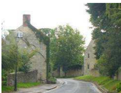
No. 8 Dunstan Road

Dunstan Road provides an important approach to the core area of the historic village from Northway and Marston but provides a contrasting character to the historic core. The area is focused along the long narrow space of the road. This has a pavement on the north side and a grass verge to the south, which is bounded by either a low, ivy-grown wall or a hedge that has grown into a mature tree line, both of which contribute to a pleasantly rural and occasionally sylvan character. Mature trees arch over the road from both sides creating a tunnel