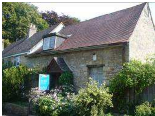
No. 18 St Andrew's Lane a small workers' cottage, probably of 18 th or early 19 th century construction

farms represented by the larger houses. A relatively high proportion of these buildings have been lost and replaced, including the ten on St Andrew's Road that were demolished in the 1930s. The remaining examples are to be all the more valued as survivors.