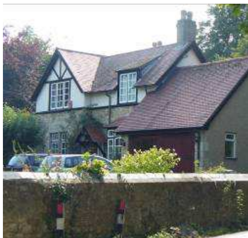
No. 6 The Croft

materials and features. Again the use of limestone helps to integrate these buildings with the older structures of the village.