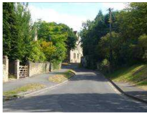
View south along St Andrew's Road between Green verges

Old High Street and The Croft, St Andrew's Road and Osler Road, and the small space between the Laurel Farm Close development and The Croft. These small green spaces contribute to the informality of development that is part of the rural character of the village, as well as forming part of the greening of the streetscene. The grass banks and verges on several routes in the conservation area, including Osler Road, Barton Lane and Dunstan Road make a similar contribution and help to maintain the 'ring of green space' that separates the village core from the surrounding suburban development.