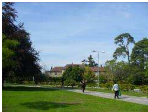
View to Headington Manor at The John Radcliffe Hospital

These views serve to highlight the importance of these buildings and often include supporting features including trees, other planting and sympathetic boundary features that are part of a designed view.