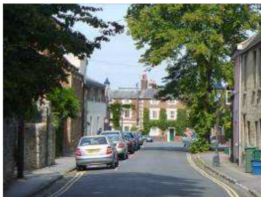
A channelled view along Old High Street

View type A: Views channelled along streets: Throughout much of the conservation area, views are enclosed within streets by the surrounding buildings and trees to focus attention along the routes of roads. These views emphasise the importance of the street pattern to the structure of spaces within the village and to the historic development of the settlement along it. The gentle rhythm of divisions between buildings and properties provides a key element to these views. The views north and south along Old High Street in particular benefit from the pinch-points, where the road is narrowed or where large trees arch over the road, often providing a small focal point in the distance. The trees and greenery of the village gardens make an important contribution to the character and aesthetic quality of these views