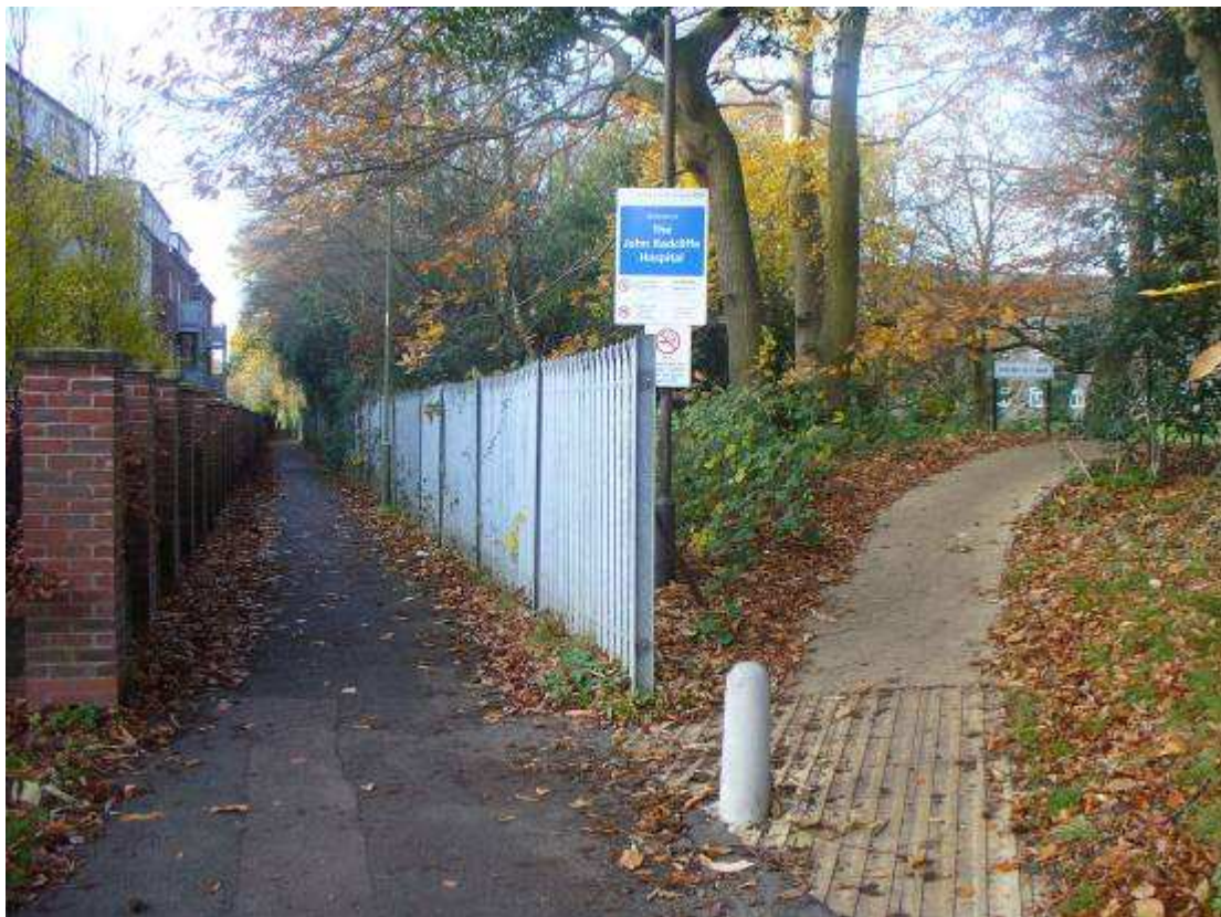
View west at Cuckoo Lane

Between Old High Street and Osler Road the course of the footpath was straightened in the 19 th century and excavated to run below the ground level of the gardens and parkland of Headington House. This would have allowed the owners of the house to view their estate, including the parkland south of Cuckoo Lane (which has now been developed over), without having to see passing travellers in their vista. The path's sunken course, which is now accentuated by overhanging trees and the fences of adjacent properties, provides visible evidence of the power of these wealthy landowners over the landscape surrounding them in the late 18 th and 19 th