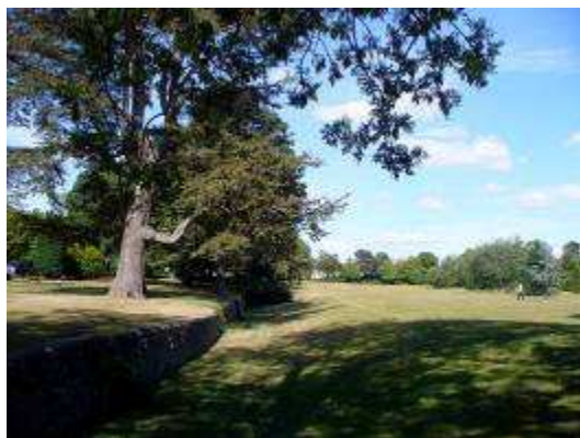
The ha-ha at Bury Knowle Park

Views across the parkland in the south and east are particularly attractive as a result of the combined elements of the wide, green open space, its historic settings, which includes including the park walls and surrounding buildings such as the village school and post-office on the south side of London Road), and the mature tree planting. Historically significant trees include specimen trees, planted to ornament the parkland, trees lining the boundary with London Road, which act as a screen to views from the street and an avenue running along the western edge of the park, which marks the former carriage drive to the house from gates on London Road. More recent tree planting in the park has included the small arboretum in the east, which replaced hockey pitches, as well as a second avenue running along the path following the eastern park boundary.