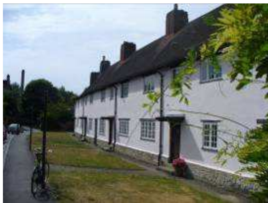
Fielding Dodd's houses at St Andrew's Road

The theme of building contemporary housing within the area continued into the 1970s with the construction of the buildings of Nos. 10 to 18 Dunstan Road in a highly contemporary style by the architects Ahrends, Burton and Koralek.