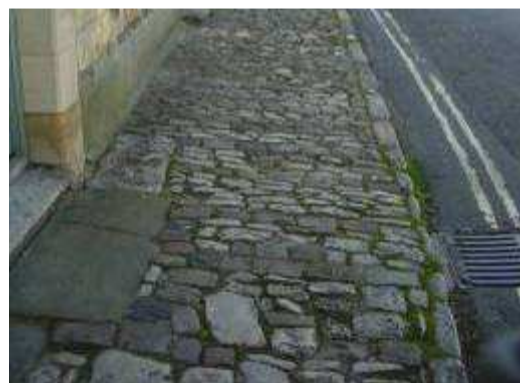
Area of listed Paving at St Andrew's Road

Paving: When many of the houses in the conservation area were built the surrounding roads would have had a basic surface of beaten earth as preserved in the small footpath near No. 8 The Croft. Areas of historic paving are decidedly unusual in rural contexts and, as such, the 18th century limestone cobble pavement outside the White Hart Inn is a particularly rare survival and makes a significant contribution to the setting of the adjacent group of listed buildings. As such it has been given listed building status in its own right. The pavement has been re-laid in the recent past, somewhat inexpertly, but still makes an important contribution to the character of this part of the conservation area.