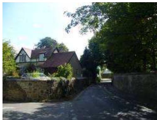
View west at Osler Road, including No. 6 The Croft