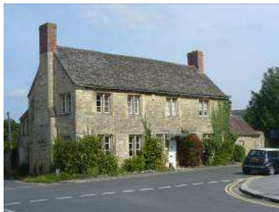
Mather's Farmhouse, dating from the 17 th century, forms a landmark at a focal point in the conservation area.

(No. 12). In the former this appears to be an original feature and, as a result, the front door to the building is located at the right hand extremity of the frontage with narrow windows lighting the area of the frontage in line with the chimney. At the White Hart, the main façade of the building was refronted in two sections suggesting it was divided into two properties at one time, with the central chimneystack rising between the two halves.