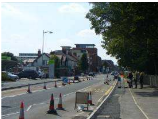
London Road south of the conservation area

Along the southern edge of Bury Knowle Park the conservation area adjoins and includes part of the busy route of London Road. This is an important traffic route into the city from the east, as well as serving the residential areas and business of Headington. Facing the conservation area London Road has a very mixed frontage, which includes historic buildings of local significance such as St Andrew's Primary School and the Victorian-era Post Office, as well as small high street businesses, private houses and a small supermarket. The long, straight route of London Road provides dramatic views along the front of the park's boundary walls.