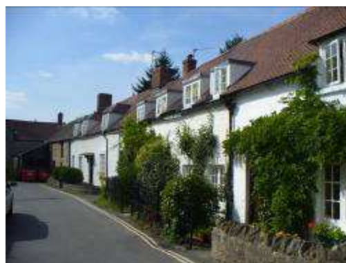
View west along cottage frontage at The Croft