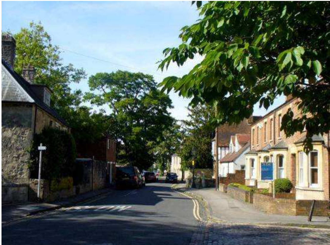
View north at Old High Street

This area contains the central streets of the historic village, with long and gently sinuous paths and a strong sense of enclosure provided by closely spaced or informally terraced buildings built at the back of pavement, behind small front gardens or with high garden walls of local limestone to the road. This area contains the focus of the seventeenth and eighteenth century houses, cottages, inns and farmsteads as well as the medieval core of the village around the parish church of St Andrew. It has a quiet, residential character, with only four non-residential buildings (two churches and two public houses), although it preserves the evidence of shops and businesses that reflects the historic village as an independent community. Buildings are generally low in scale, only occasionally