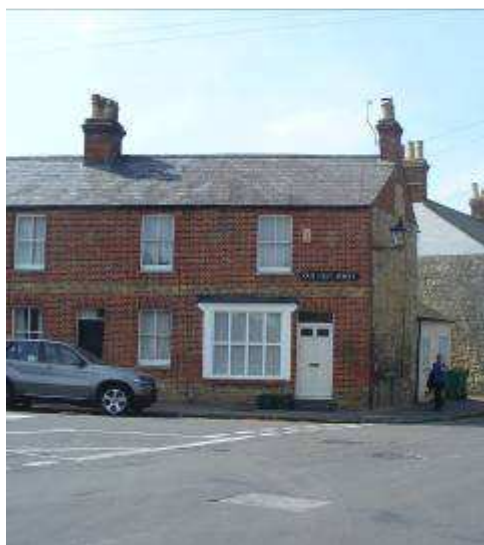
The Old Post Office at No. 94 Old High Street

box to the sidewall, despite its conversion to residential use. This was Headington's first post-office and continued in use as a grocer's shop first under the name of Rudd's and subsequently under several owners. It remained as a shop until the 1970s. Just a few doors to the south, the small Whitewashed cottage at No. 86 Old High Street was a butcher's shop owned by another member of the Berry family. It has been restored as a dwelling in recent years with the loss of the shop window.