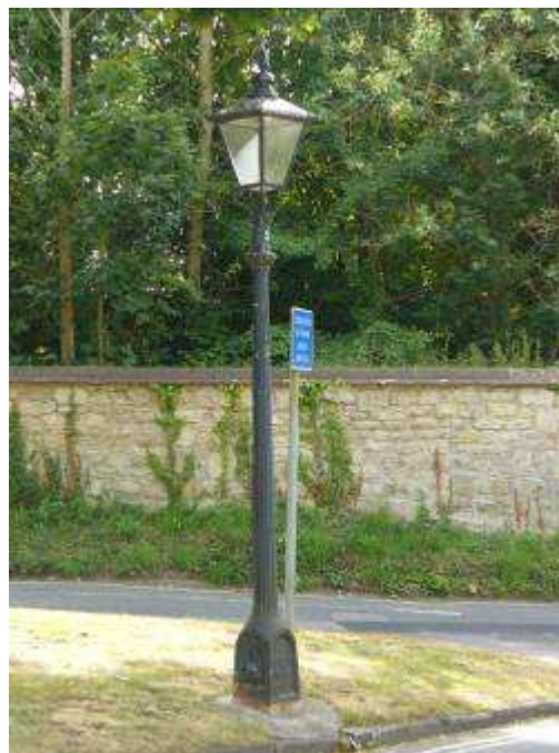
A 'Lucy and Dean' lamppost

The parkland areas have specific furniture, which reflects their use as a recreational and community resource. These are described in more detail in the character area descriptions below.