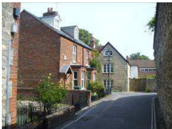
Groups of buildings cluster around narrow lanes at The Croft

metres from the Old High Street entrance, runs through to Osler Road with the grounds of Headington House and Sandy Lodge on its south side. On its north side there is a scatter of development including Victorian semi-detached cottages, older houses of 17 th , 18 th and early 19 th century construction, as well as the small converted chapel of Croft Hall. The side boundaries of properties in the Laurel Farm Close development form a significant portion of the northern side of this path. A side spur also provides access to Osler Road at The Court. West of this point a more continuous frontage of houses and cottages addresses the footpath on its north side. The second, northerly arm running off the main north-south route has a continuous frontage of small cottages and other buildings on its north side but is more open to the south, with some open plots running through to the southerly arm. At its west end this route narrows to an unusual unmetalled green footpath that runs in front of No. 8 The Croft and curves around to the south to join the southerly arm next to Croft Hall.