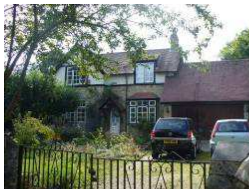
No. 6 The Croft

There is little or no differentiation between the surfaces for motor vehicles, pedestrians or cyclists, except where bollards restrict access to vehicles. The amenity and safety of this environment for pedestrians and cyclists is dependent on the maintenance of minimal traffic movement. It was pointed out during public consultation that this is still an area where children can play in the street. The numerous points of access, including routes through Laurel Farm, from Osler Road, St Andrew's Road and Old High Street, and the position on the routes to shopping areas on London Road or the public facilities at Bury Knowle, means that this area is popular with and very well used by pedestrians. The lack of traffic movement and noise also provides a distinct air of tranquillity, highlighted, on occasion, by the sound of the bell ringing at St Andrew's church (including the regular Tuesday night practice) or singing at the Baptist Church.