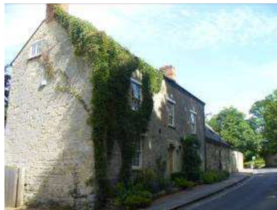
Lower Farm (No. 8 Dunstan Road), built around 1800 is a late addition to the group of vernacular farmhouses and cottages

and the booming university town as from agriculture.