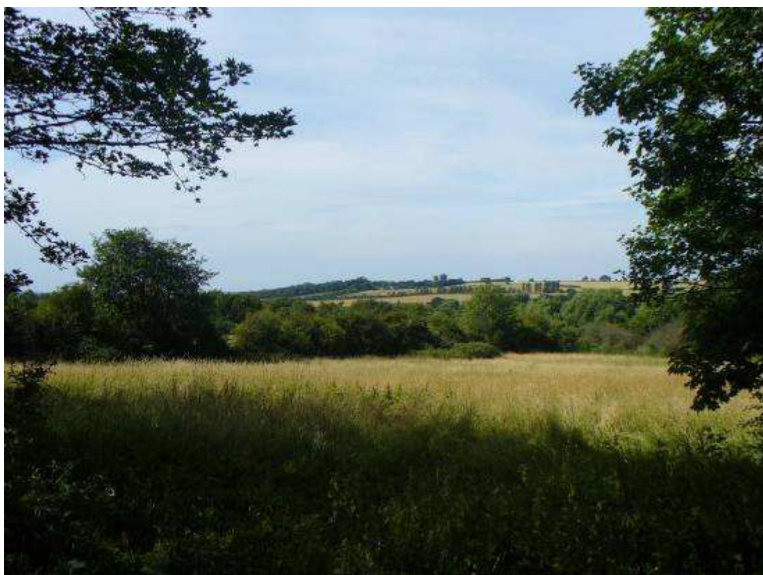
View north west from Stoke Place bridleway

Stoke Place is continued within this area as an attractive public bridleway running northwards from the Dunstan Road Character Area lined by trees that help green it. The bridleway runs up to the ring road between land owned by Ruskin College and other privately owned fields. To the west, iron railings with an unusual gate form a distinctive boundary to Ruskin