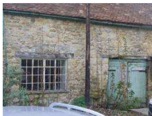
Details of the barn doors and windows at Bury Knowle