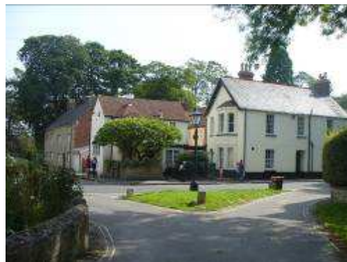
A small green space between Old High Street and The Croft

two of these landscapes. Along with the parkland and small fields, these larger gardens provide a buffer of open space between the village and surrounding urban development that helps to preserve its rural character.