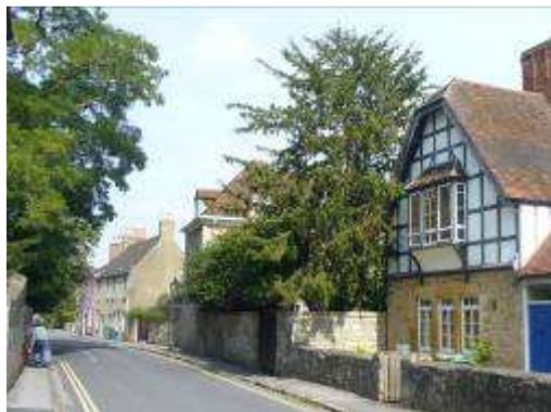
The British workman (right of frame), Old High Street

playground and pavilion. The house was converted for use as a public library in 1934 and the upper floor came to house the mother and baby clinic that had operated from the British Workman