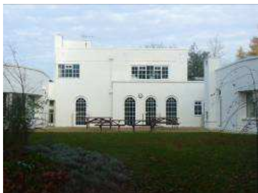
William Osler House, The John Radcliffe Hospital

Of the early 20 th century houses in the conservation area, a few stand out as particularly interesting. Between 1912 and 1925 The Hermitage (No. 69 Old High Street) was developed from a part of the former maltings into an attractive Georgian style house by a former keeper of Fine Art at the Ashmolean Museum. The conversion is convincing and anyone would be forgiven for thinking the building to be at least a hundred years earlier in origin than it actually is. William Osler House, recently substantially extended, is quite different and provides the village's only example of the white rendered modernist style. It was designed by Stanley Hamp in 1931 for the administrator of the developing Radcliffe Infirmary premises at Headington. It is now used as teaching facilities for the hospital.