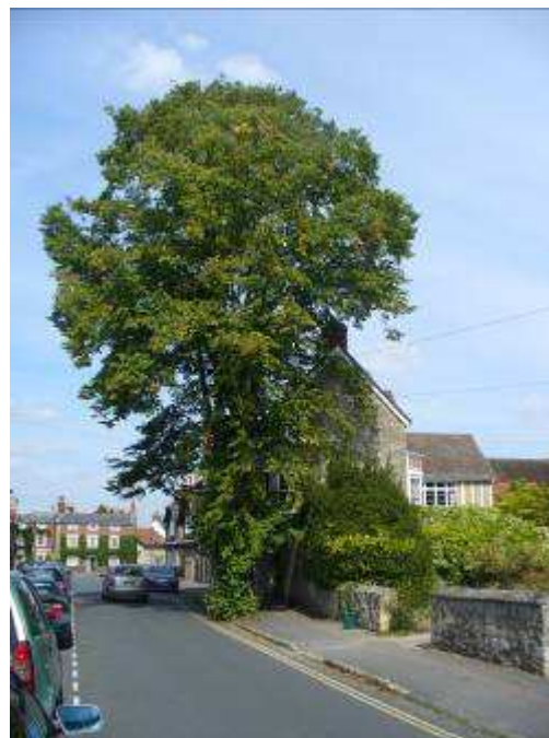
Mature lime trees at Old High Street

Within the conservation area the spaces where the public have a right of access (referred to as the public realm) include the parks, streets and alleys. The materials used to pave these areas, the planting and street furniture all make an important contribution to their character.