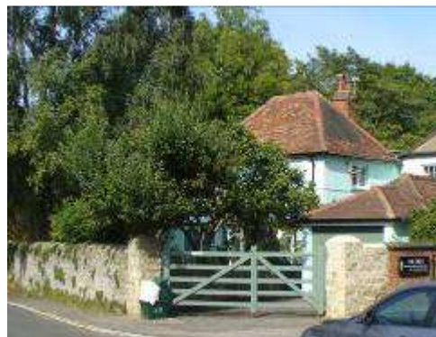
No. 1 The Croft

would have run around. This may suggest it was removed from the estate when it was subdivided. Alternatively it may have stood within the grounds of Headington Manor, at one corner of its kitchen gardens but was later cut off by a re-routing of Cuckoo Lane to the course of Osler Road.