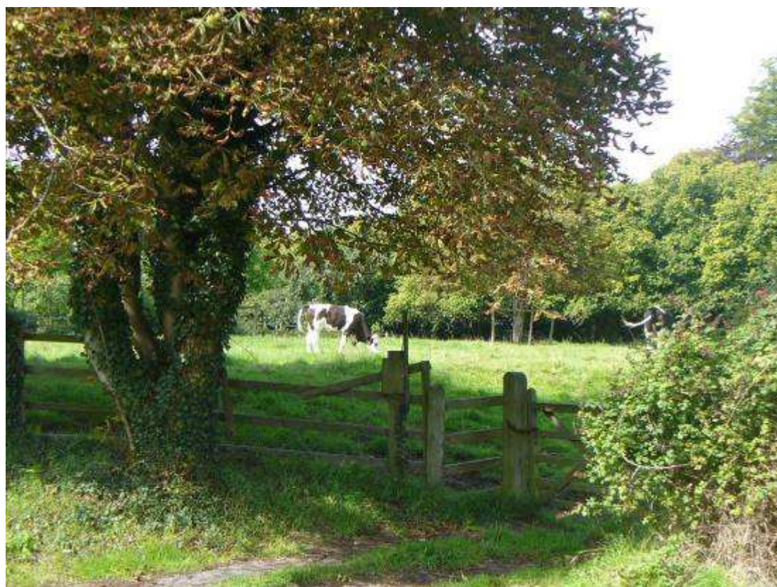
Oxford Preservation Trust’s fields at Barton Lane