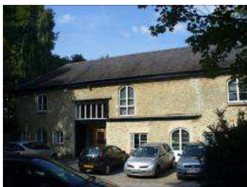
The former coach house at Bury Knowle, now used as offices

storeys, often with additional wings of a lower scale that were built to provide extra accommodation, as it was required. They are also distinguished from the farmhouses by the types of ancillary buildings with which they are associated. These include coach houses and stables, walled kitchen gardens, gate lodges and high boundary walls to their parks. These buildings are often just as ornate as the main house. The boundary walls have ornamental brick copings and monumental gate piers. The houses and their ancillary buildings stand well away from the roadside and are now often hidden from the road, although they may once have been more visible in designed vistas.