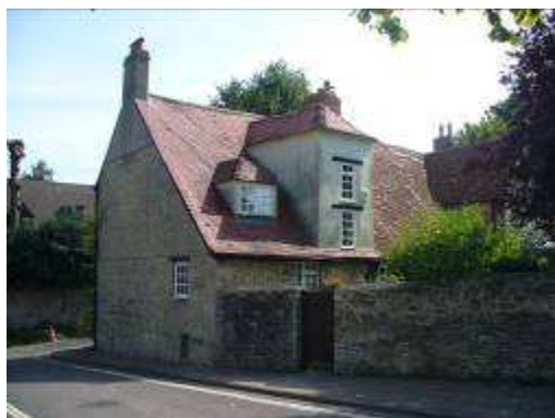
The rear of Church Hill Farm showing the stair tower and 'cat-slide' roof

are seen at The Court, The Croft and Church Hill Farm, St Andrew's Lane, whilst the stair-tower at No. 14 St Andrew's road was apparently rebuilt in brick in the 19th century. Church Hill Farm also provides a good example of the cat-slide roof added at the rear to cover two single storey extensions either side of the stair-tower. Where space has allowed, or where the street pattern facilitates it, these early buildings have an east - west axis that makes efficient use of available daylight. Some of these properties were subdivided using the central passage as a natural point of division, as recorded at No. 16 St Andrew's Road.