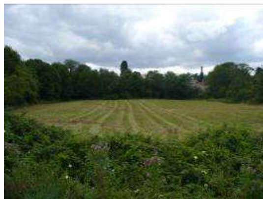
Trees line the edges of small fields to the north of Ruskin Hall

apple varieties. The derelict garden plot in The Croft also contains several veteran apple trees that may represent historic local varieties.