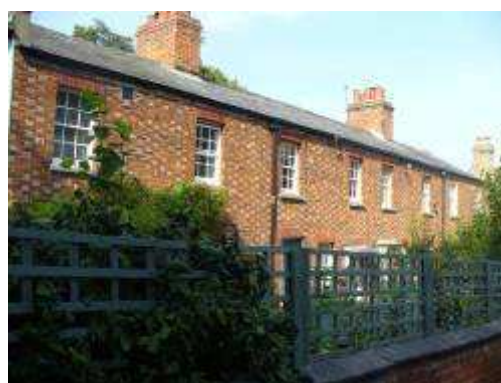
Nos. 2 – 5 The Croft

The tall trees in the grounds of Headington House form a backdrop to views south and west across this area and create a tunnel of foliage over the arm running to Osler Road.