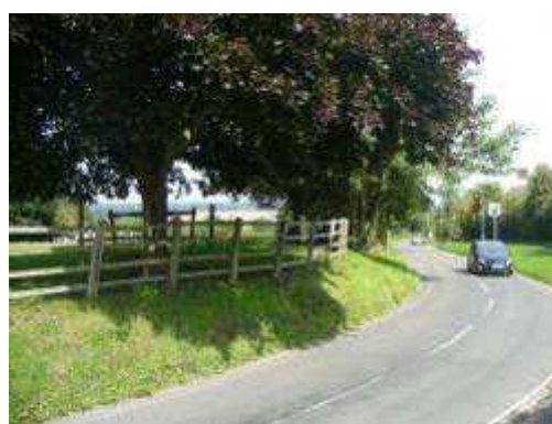
Views East at Barton Lane

This area includes the remnants of the agricultural land on the edges of the historic village, which have been separated from the surrounding landscape