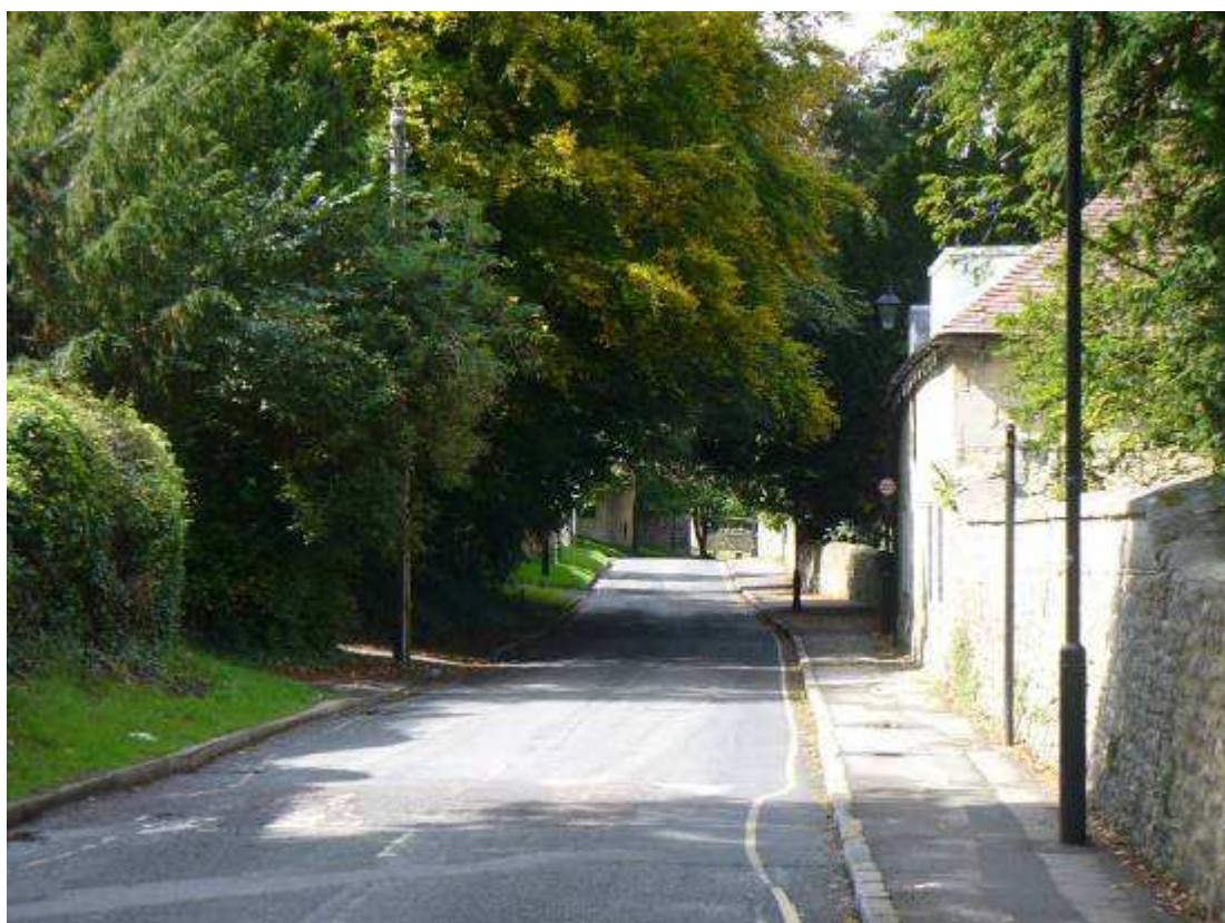
View west along Dunstan Road