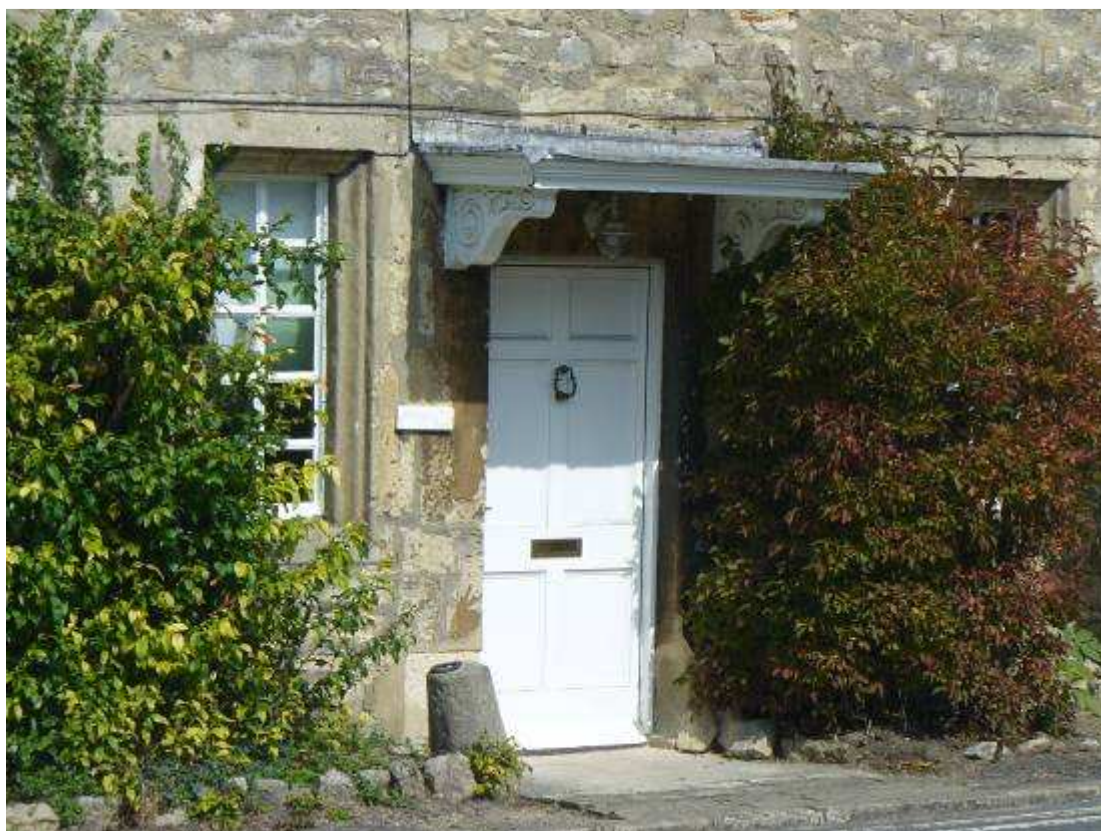
Front door of Mather's Farmhouse, Barton Lane

Within the conservation area numerous unlisted historic buildings make a positive contribution to its character and appearance. These buildings are illustrated on Map 3. However, where a building has not been marked this should not be taken to mean that it is of no interest but may reflect lack of access to land during the survey for this appraisal.