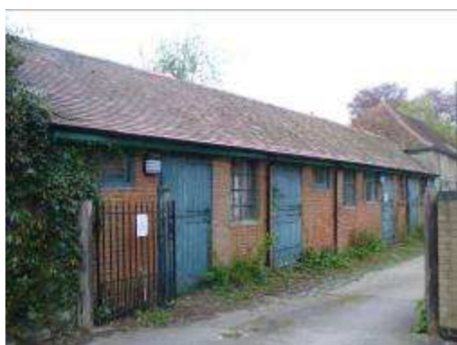
Late 19 th century stable building at Bury Knowle

Villa built in the first years of the 19 th century and represents a part of the move of wealthy Oxford merchants out of the city centre to the healthier climate of Headington Hill. It retains its associations with subsidiary structures, such as the coach house and stables, which were once required to support the high status lifestyle of its owners. The immediate surroundings of the house retain some of the polite landscaping of the 19 th century pleasure grounds that surrounded the villa, including exotic specimen trees, such as the large cedars to the front, as well as the ha-ha or sunken fence that allows views from the house to sweep across the lawns to the open parkland beyond.