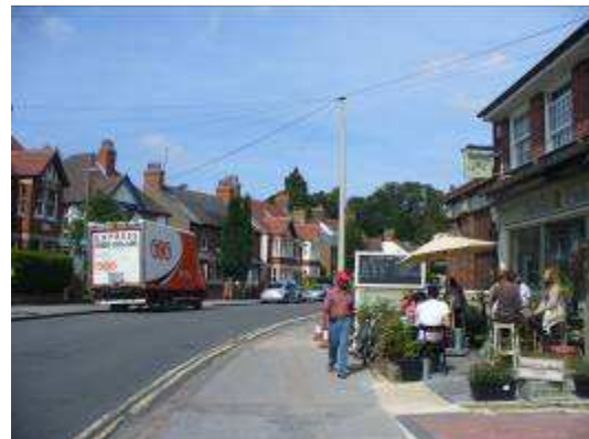
Old High Street view looking towards the conservation area

The conservation area lies at a transitional point between the suburban landscape of Headington and the rural hinterland beyond the ring road. To the north west, Dunstan Road runs steeply downhill to the Northway Housing Estate at Saxon Way. Headington Cemetery covers the ridge of the hill to the south of Dunstan Road and the vast complex of the John Radcliffe Hospital lies directly west of the conservation area. Here the surviving open parkland and buildings of Headington Manor inside the conservation area provide a contrast with the monolithic elevations of hospital buildings just outside its boundary. Osler Road continues south from the conservation area as a residential street of Edwardian or Inter-War houses, as well as including the green of the Headington Bowls Club and the site of the new Manor Hospital (formerly the home ground of Oxford United Football Club). Osler Road leads into the shopping area on London Road just to the south.