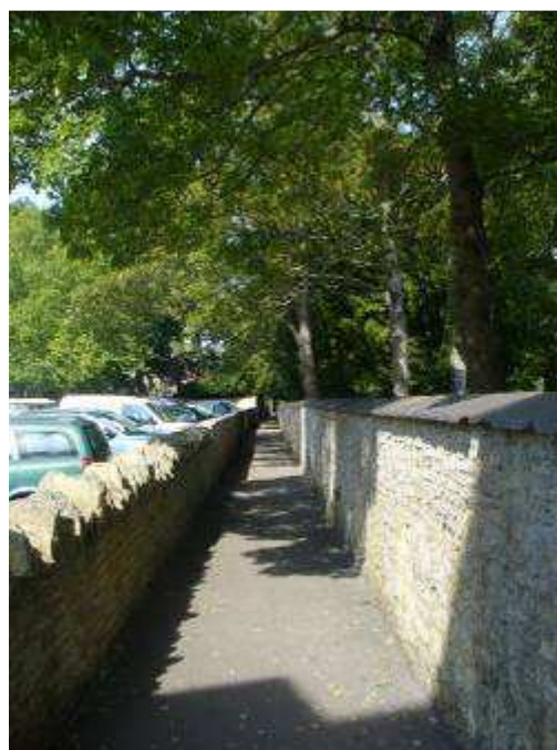
Coffin Walk next to Bury Knowle Park

Headington on Corpus Christi College's map of its landholding produced in 1605. Between Osler Road and Old High Street it runs along a sunken course, with banks to either side, which are topped by garden fences and shrub growth. Stephen Road provides a gap in the enclosure of the southern side of this alley. A third narrow alleyway runs along the western edge of Bury Knowle Park. It is named Coffin Walk, recording the creation of this route as an alternative to the processional route for funeral parties from Quarry to St Andrew's Church across Bury Knowle Park before the building of Quarry Church.