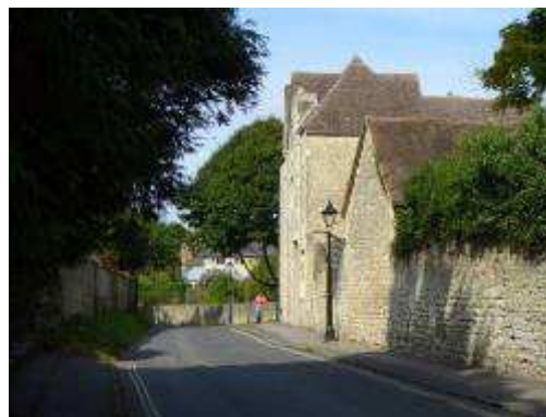
View north at Osler Road, including St Andrew's House

channel views along the road. None of these buildings address the street directly, with entrances on other streets or through gardens. They are well spaced in large plots and rise up to three stories at the Old Pound House and St Andrew's House. However, they are of a more domestic scale than the mansions to the south. The break in the line of vision along Osler Road, increased enclosure of the road and change in scale and spacing of the buildings provides a comfortable transition in character between the larger properties and formal landscapes to the south and the densely built-up village core to the north.