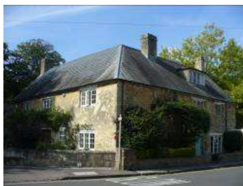
Corallian limestone with a lime render weather coating

lime mortar is important with this material to prevent damage through differential shrinkage and moisture retention, potentially leading to saturation and damage. It was used for buildings in mass (solid) wall construction, often with very thick walling that have a high thermal mass if well maintained. This is a heavy form of construction and its use determined the positioning of upper floor windows over lower to reduce loading on lintels and therefore has an influence on schemes of fenestration. It also increases the difficulty of building upwards and, therefore, contributes to the long, low form of buildings throughout the conservation area.