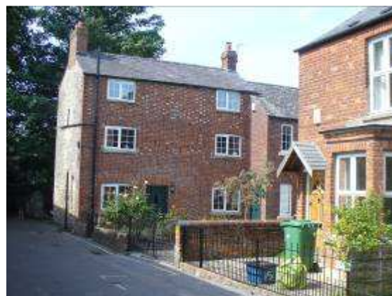
Houses of brick and stone at The Croft, built in the mid and later 19 th century

In 1850 Quarry had grown to a size that justified its independence from Old Headington through creation of a separate ecclesiastical parish. During the 1860s sale of farmland south of London Road enabled the New Headington suburb to develop between the two older settlements. The rate of development escalated rapidly after the sale of Highfield Farm, although in the 1870s Headington was still described as an agricultural parish growing wheat and barley. The economic fortunes of the parish had clearly recovered by the mid-century and in 1864 major restorations were undertaken to St Andrew's Church, including a westward extension of the nave by the locally significant architect J. C. Buckler. A north aisle was added to provide even more accommodation in 1881 along with the north porch and vestry.