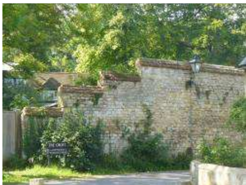
Stone boundary walls at The Croft

neighbours. Now they create intimate, enclosed areas with a tranquil ambience.