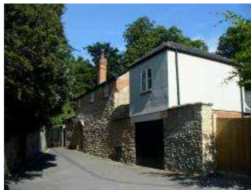
The Coach House, The Croft

Houses throughout the area are of a consistent low scale, rarely of more than two stories, whilst the cottages at Nos. 9, 11 and 11a The Croft are a group of single storey cottages with additional attic rooms lit by dormer windows. The character of individual materials throughout this area, such as the distinctive colouring and texture of both the locally produced handmade brick of the early 19 th century and the later 19 th century wire-cut bricks is immediately appreciated due to their proximity to the pedestrian.