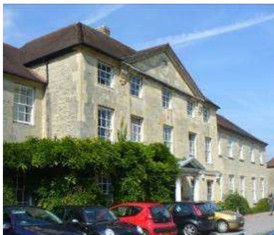
Headington Manor, built by Sir Banks Jenkinson in 1779

the map accompanying the enclosure award, although the present building was clearly remodelled later in the 19th century.