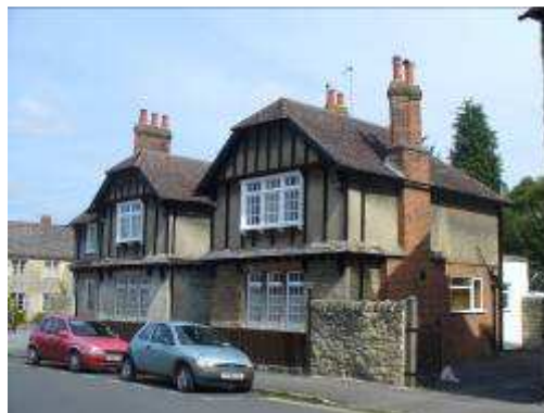
Linden Cottages, Old High Street

The new building was prominently located on Old High Street facing Linden Farm. A convent of Dominican Sisters bought Linden Farm in 1923, and renamed it as "The Priory of All Saints and All Souls", which was in turn purchased by The Congregation of The Sacred Heart in 1968 who simplified the name to The Priory. They used the building as a mixed religious institution and students' hostel. The local builder Charlie Morris replaced the three cottages just to the north of the Priory in 1909 with two semi-detached cottages in a heavy half-timbered Olde English style. Their new name 'Linden Cottages' is spelt out in initials carved in relief on the brackets that support the jettied first floor.