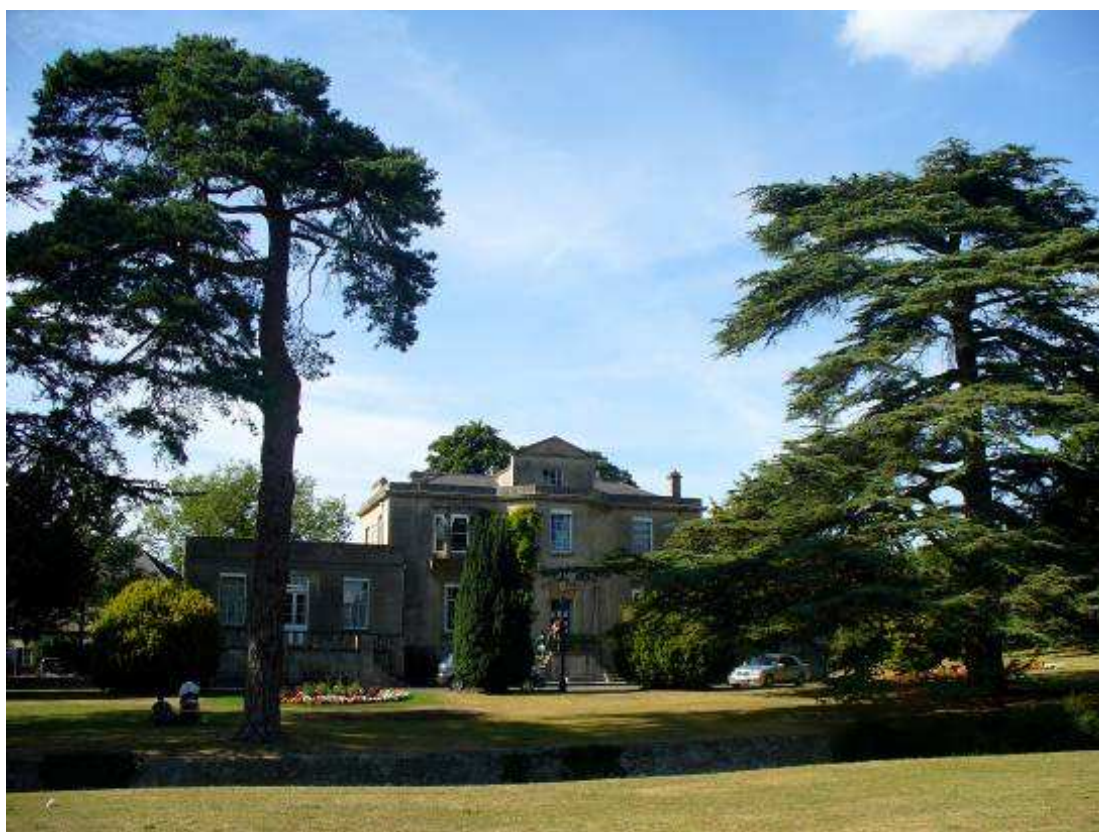
Bury Knowle House

Bury Knowle House, which stands at the centre of this landscape, is an Italianate