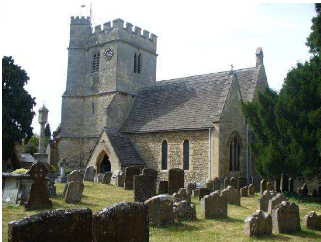
St Andrew's Church

The manor of Headington remained in the ownership of the king throughout the 11 th century and was the second of the king's properties recorded in the Domesday Survey of Oxfordshire in 1086. This reflected the importance of the estate which provided the king with an annual income of £60.