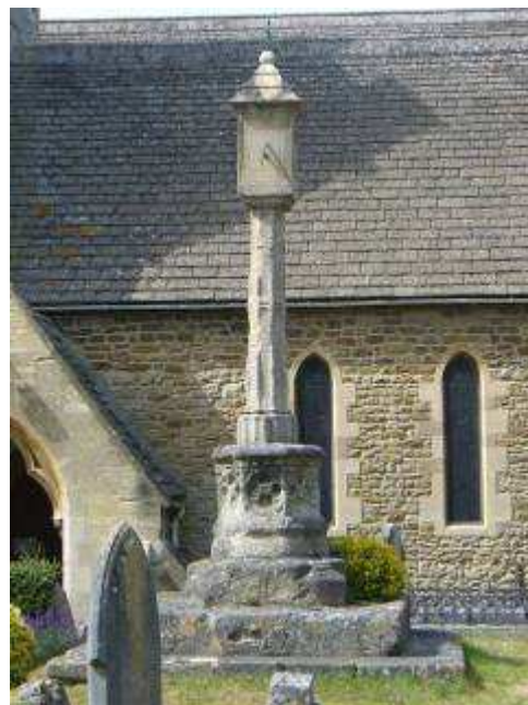
The village's medieval cross in the St Andrew's churchyard

The mid-12 th century village of Headington, next to its stone church, would have stood at the centre of an extensive agricultural landscape of open arable fields lying to the east, south and west. A smaller amount of pasture land was located directly to the north of the village and must have been a closely guarded resource, used for both livestock and draught animals (see the Green Fields Character Area, below). A main street along the line of St Andrew's Road would have lain just above the spring line. The boundaries of a series of tenements running along the south side of St Andrew's Road are suggested by the plots of the modern land holdings, which run back from the street frontage around long gardens that end at a lane (The Croft) that probably provided access to small agricultural buildings on their southern boundaries. Beyond this lane the plots continued as long narrow gardens that ended at the edge of the open field. Larger properties were clustered around the main street as discrete farm units.