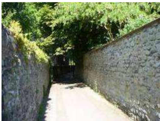
High walls of limestone rubble are a distinctive feature in the conservation area

The bed-rock beneath the village is made up of Lower Corallian beds of sands and grits interspersed with layers of limestone rubble, which provides a long-lived building material as roughly coursed walling, for which it has been used throughout the village. However, it is not suitable for finer masonry. Quarries to the south east of the village provide access to the Upper Corallian series, which include the Headington Hardstone, used for building plinths and kerbs, as well as the softer freestone. The latter was prized for more intricate work and fine ashlar until the 18 th century, by which time its poor weathering qualities had become all too evident throughout Oxford's churches and college buildings. Some examples of both stones are found within the village, although freestone from Barrington and Taynton, near Burford, are also found. Lime for building mortar was reportedly brought from Witney.