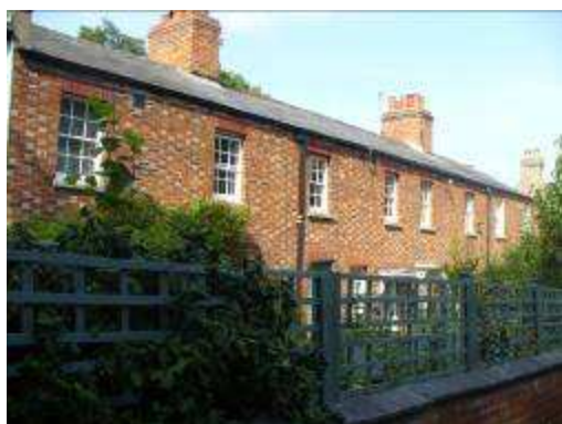
Nos. 2 – 5 The Croft

The 19 th century also introduced a cohort of brick-built houses, some of which contribute to the locally distinctive use of handmade Shotover bricks laid in Flemish bond with blue or 'dust-brick' headers forming a decorative chequer-work pattern. These include Nos. 16 The Croft, 35 St Andrew's Road and Nos. 2 – 5 The Croft, which have idiosyncratic features of design and fenestration that set them apart from mid and later 19 th century brick cottages built to more widely represented designs. Examples of the latter are seen in the village and reflect the encroachment of speculative development into the village in marginal areas such as The Croft, St Andrew's Lane and the western limit of St Andrew's Road and in larger groups on Old High Street.