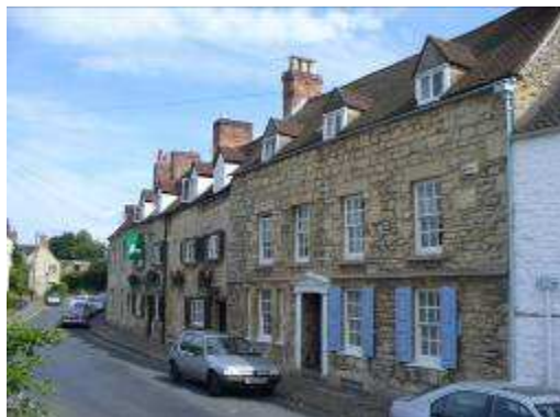
View along the St Andrew's Road frontage

attractive group of cottages at Nos. 8 – 11a The Croft, is of particular note and must be truly picturesque in high summer, when the small cottage gardens are full of flowers.