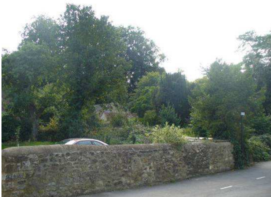
View across gardens at The Croft towards Headington House