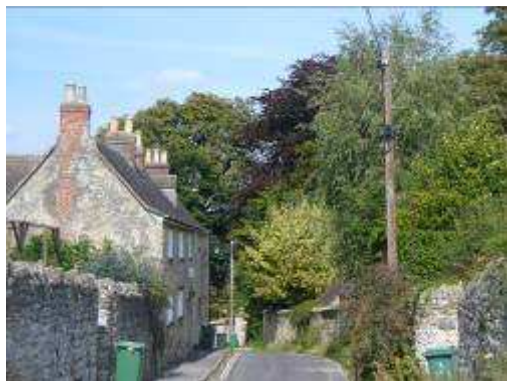
Trees in the grounds of The Grange provide an attractive backdrop to views from Larkins Lane

including Ruskin Hall and The Grange, as well as the John Radcliffe Hospital have a similar effect elsewhere.