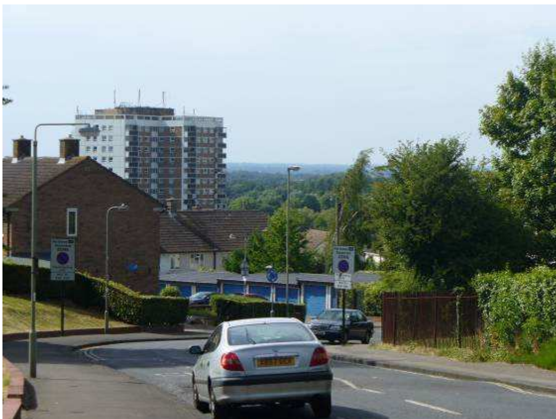
View west out of the conservation area from Dustan Road looking over suburban housing to the Cherwell and Thames Valleys

The limestone of Headington Hill gave rise to well drained soils that would have been easily cultivated and much of this area was arable land in the open fields of Headington until enclosure at the