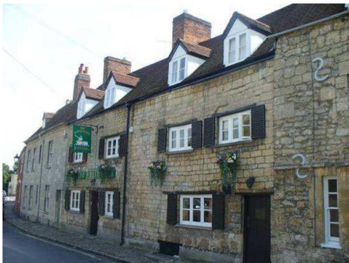
The White Hart Inn, St Andrew's Road

These new buildings and the 1605 map of Headington demonstrate the existence of both Larkin's Lane and St Andrew's Lane in the early 17 th century. The 1605 map reveals that a 'common well', located on the spring-line approximately 150 metres north of St Andrew's Road, was the destination of both routes, which must have been an important resource to the community and particularly to cottage dwellers who may not have had their own wells. The map also shows one of the college's properties located on St Andrew's Road, with a yard behind and a separate garden just to the south, forming the pattern still preserved in the frontage buildings at St Andrew's Road, with the gardens at the rear as preserved adjacent to No. 17 The Croft. A road named Oxford Way is shown following the modern alignment of Cuckoo Lane and running up to Old High Street. This was the main route from Oxford to Headington until the later 18 th century. A northerly branch of this road ran up to the western end of St