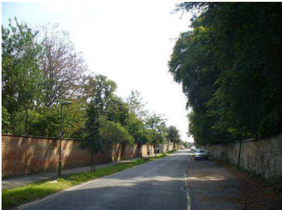
View south along Osler Road

As a result of their inclusion in the grounds of the John Radcliffe Hospital, the buildings and formal landscape of Headington Manor are accessible to the public. Unfortunately, the construction of