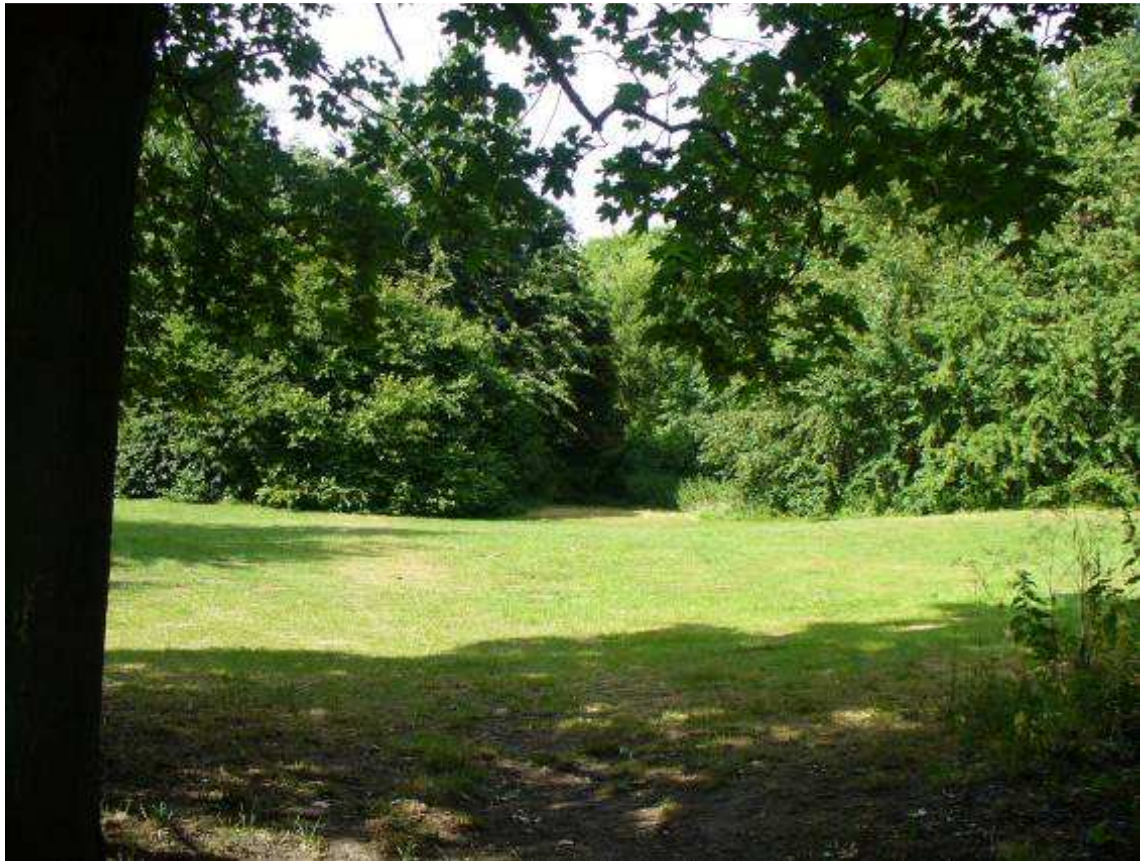
Green open spaces at Dunstan with opportunities for wildlife

and movement of wildlife into the centre of the village.