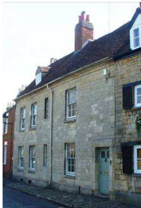
No. 10 St Andrew's Road

to provide symmetry and proportion in conformance with neo-classical ideals.