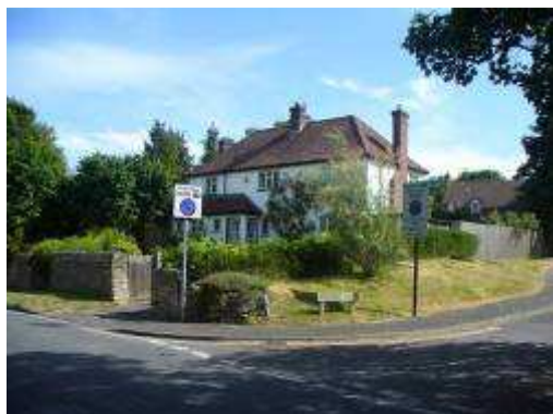
Orchard End, Dunstan Road

The process of villa or mansion building by wealthy Oxford merchants is represented on Dunstan Road by Ruskin Hall (originally The Rookery). Like the village's other mansions, this property preserves the genteel landscape of villa or mansion with associated coach house, walled kitchen garden and pleasure grounds with exotic tree planting, all within the enclosure of a high stone wall. Ruskin Hall is unusual, however, in having been taken up for the use of Ruskin College as a higher education establishment in the mid 20 th century. The college is currently in process of moving from its premises in central Oxford, to the Old Headington campus and expects this to be completed by September 2012. The grounds have attractive views northwards over the small fields within the conservation area to the rolling arable countryside around Elsfield in South Oxfordshire.