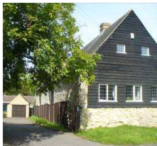
The Barn at Barton Lane stands out as a building formerly used for agriculture

In addition to the houses and cottages of the rural community, the conservation area contains several examples of the agricultural buildings that served its farms and smallholdings. Perhaps the best example of these is the 18 th century barn at Barton Lane, now converted into housing. Others include the barn to the west of Bury Knowle House, a building adjacent to No. 20 St Andrew's Road (Laurel Farm House) and another small barn in the grounds of the John Radcliffe Hospital. As noted above the White Hart Inn also retains a small barn of 18 th century construction facing onto The Croft, which retains many original features. These buildings take a variety of forms but their agricultural purpose is normally readily understood by the onlooker as a result of original features such as their barn or stable doors, distinctive window forms and absence of lighting to upper floors or attics. As such, they make an important contribution to the rural character of the conservation area.