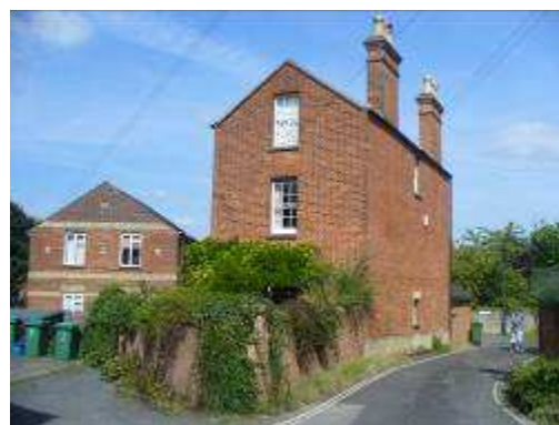
The Old Bakery at St Andrew's Lane

Several of the public and commercial buildings in the village have been mentioned in the description of the village's historical development. Most of these have now been converted to private houses. The two surviving public houses are perhaps the most visible of the commercial buildings. The White Hart has a history extending to the mid 17 th century, whilst the predecessor to the present Black Boy was recorded in the early 17 th century. The present building was constructed as a purpose-built public house in the early 20 th century in the 'improved public house' style. It may not satisfy all tastes, but does show attention to detail and antiquarianism in style, which is a hallmark of the attempt to re-brand public houses for more middle class markets. This involved use of 'Tudorbethan' and Arts and Crafts styles of architecture to recall the coaching inns of the early 17 th century. Other buildings with a commercial past include Mather's Farmhouse, which served as a bakery owned by the Berry family, until this business moved in to No. 1 St Andrew's Road, which has only recently lost its small shop window and bakery building to the rear. A second large bakery building was located at the northern end of St Andrew's Lane and has a stark appearance as a tall brick building with few windows overlooking the road and two prominent chimneystacks rising from its roadside frontage.