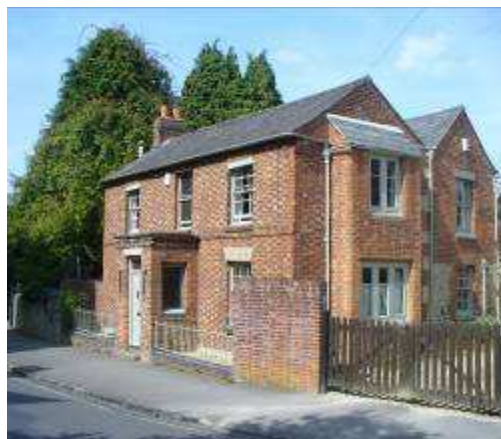
No. 35 St Andrew's Road, local red brick laid in Flemish bond

Brick: In the early 19th century the use of brick to provide, at least, the most visible facades of buildings reflects the adoption of this material as a high status material. These buildings are not uniform however and provide different styles of construction that reflect the status and prestige of their builders. The neighbouring properties at Nos. 1 and 3 St Andrew's Road have a main façade of brick, with smooth surfaced Bath stone dressings to windows jambs, lintels, quoins and a stringcourse over the ground floor. No. 35 St Andrew's Road has a brick stringcourse over the ground floor with brick sills to windows and rusticated stone lintels. No. 16 The Croft is a humbler building, originally two cottages, with significantly less architectural decoration, although the use of gauged brickwork for flattened arches to the window and door openings provides a sense of pride in construction. The terrace of small cottages at Nos. 2 - 5 The Croft provide the lowest status properties in this group and were presumably workers houses for one of the villa estates. Although they are simple buildings, they still have carefully crafted gauged-brick arches to the door and window openings.