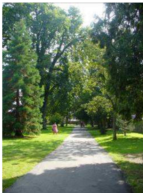
View across Parkland at Bury Knowle

The polite landscapes of the grand houses surrounding the village core have provided their own characteristic views, notably including wide grassed lawns studded with specimen trees or groups of mature trees. These have been consciously created to maximise the feeling of space and of an ordered rurality, devoid of the trappings of labour or agriculture and harkening to the landscapes of greater stately homes. The best examples of this type of view in the conservation area are seen in Bury Knowle Park. This landscape received additions during the 20 th century as a result of its role as a public park, including tree lined walks, which help to create additional designed views.