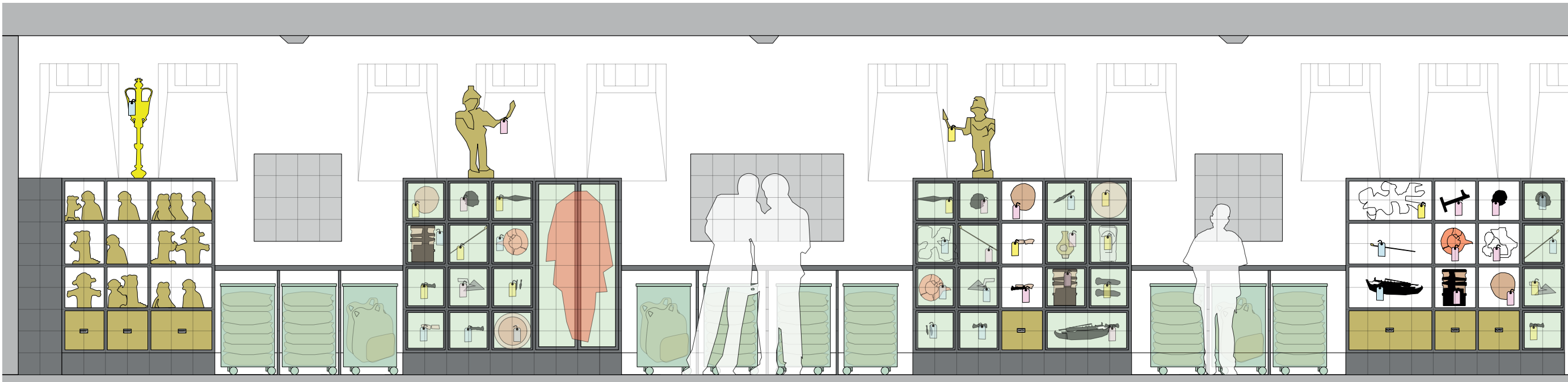
Storage for theater puppets and book case

Neither this drawing, nor any of such ideas, arrangements, designs or plans shall be appropriated or disclosed to any person, firm or corporation for any use whatsoever, except by the specific and written permission of Simon Leach Design (SLD). This drawing is for design control only and may not be used in lieu of Contractor's shop drawing. Written dimensions on drawings shall have authority over scaled. Contractors and manufacturers shall verify and be responsible for all dimensions and conditions on the job and inform SLD of all variations from drawing prior to performing the work. SLD shall first see and approve Contractor's full-size shop details before fabrication. It is the Contractor's responsibility to verify and ensure the structural integrity of this design with a licensed structural engineer.