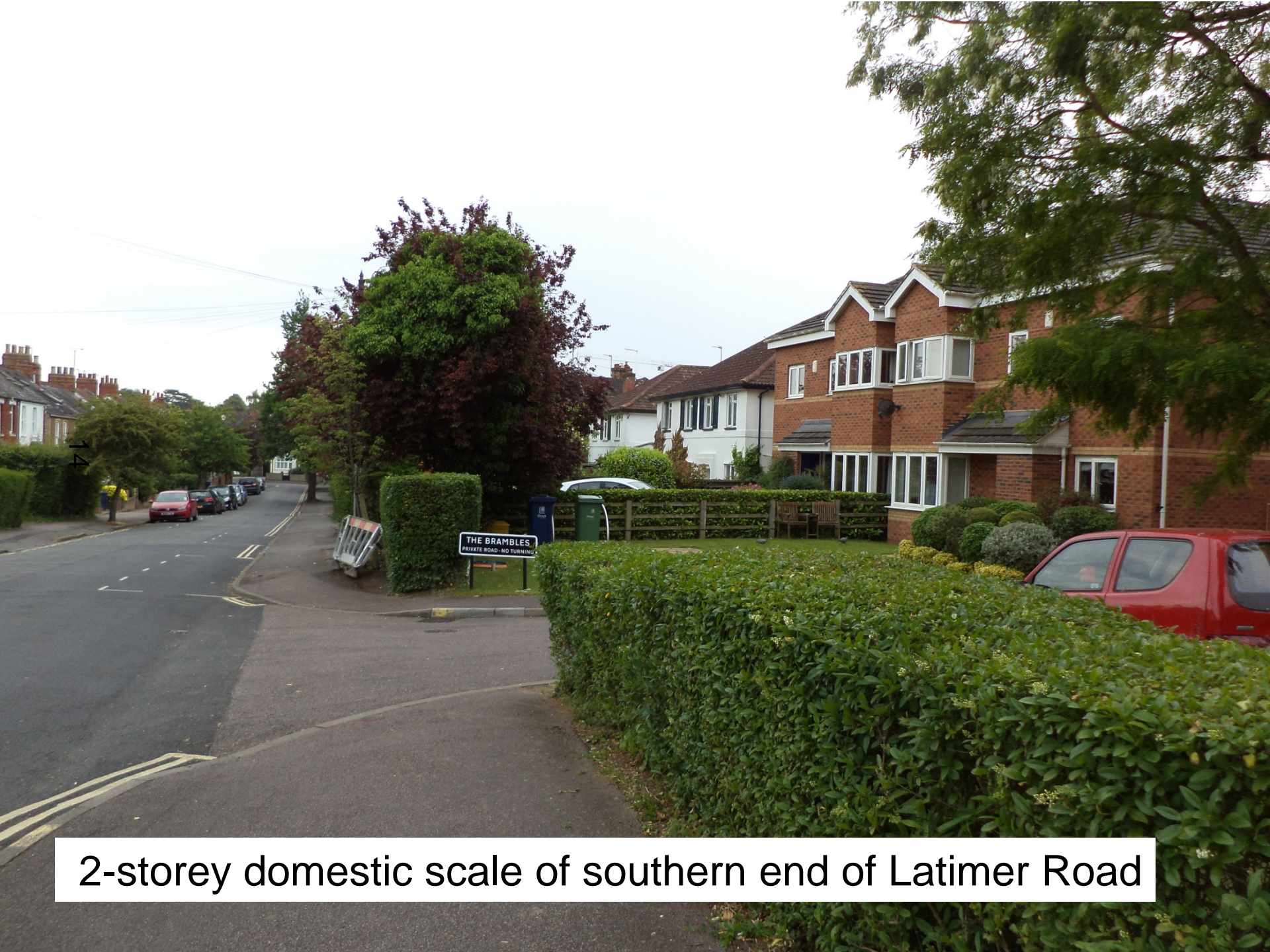
2-storey domestic scale of southern end of Latimer Road