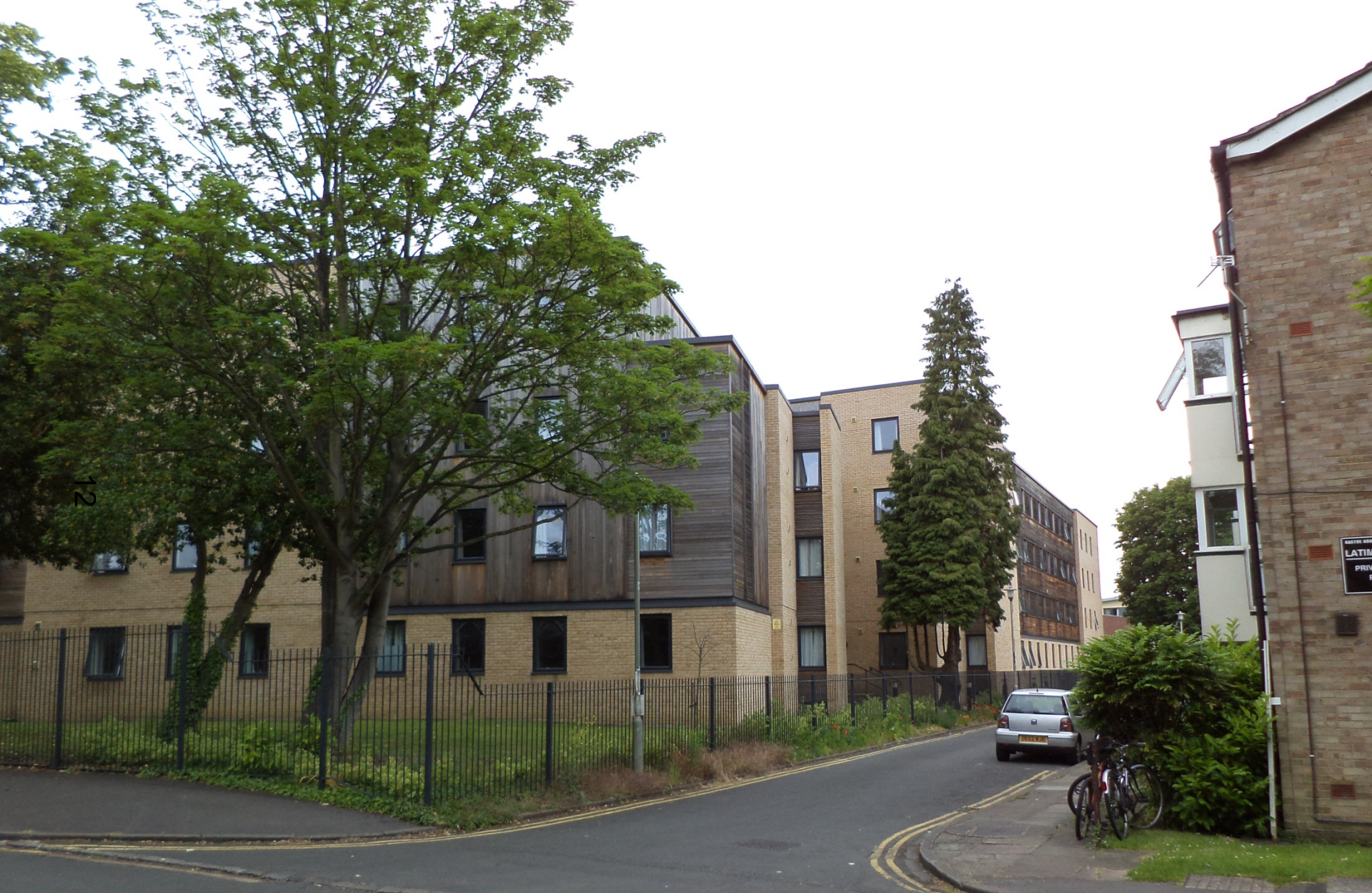
Rear of Dorset House student accommodation from Latimer Road