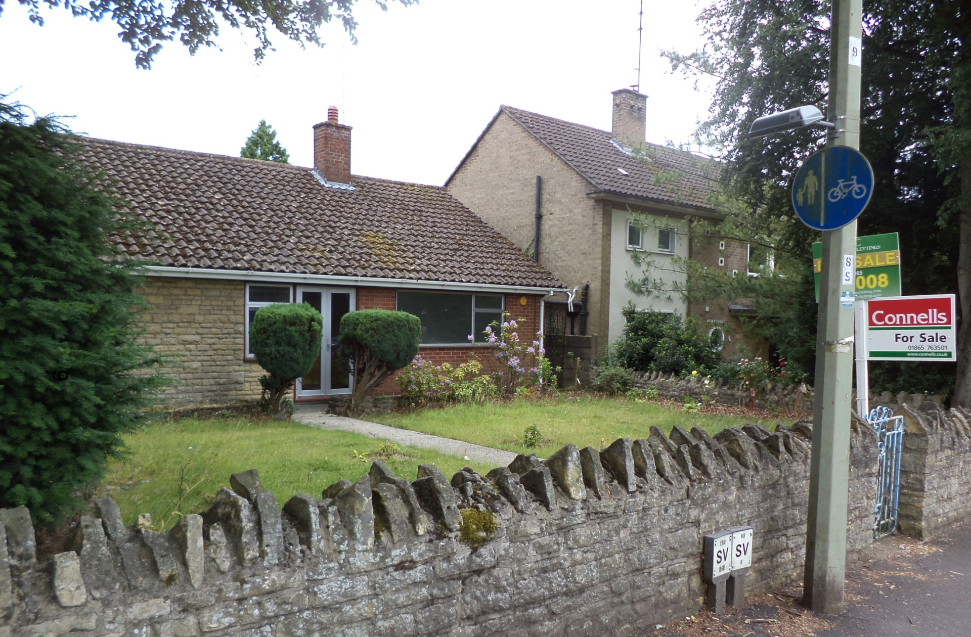
Properties within the site viewed from London Road