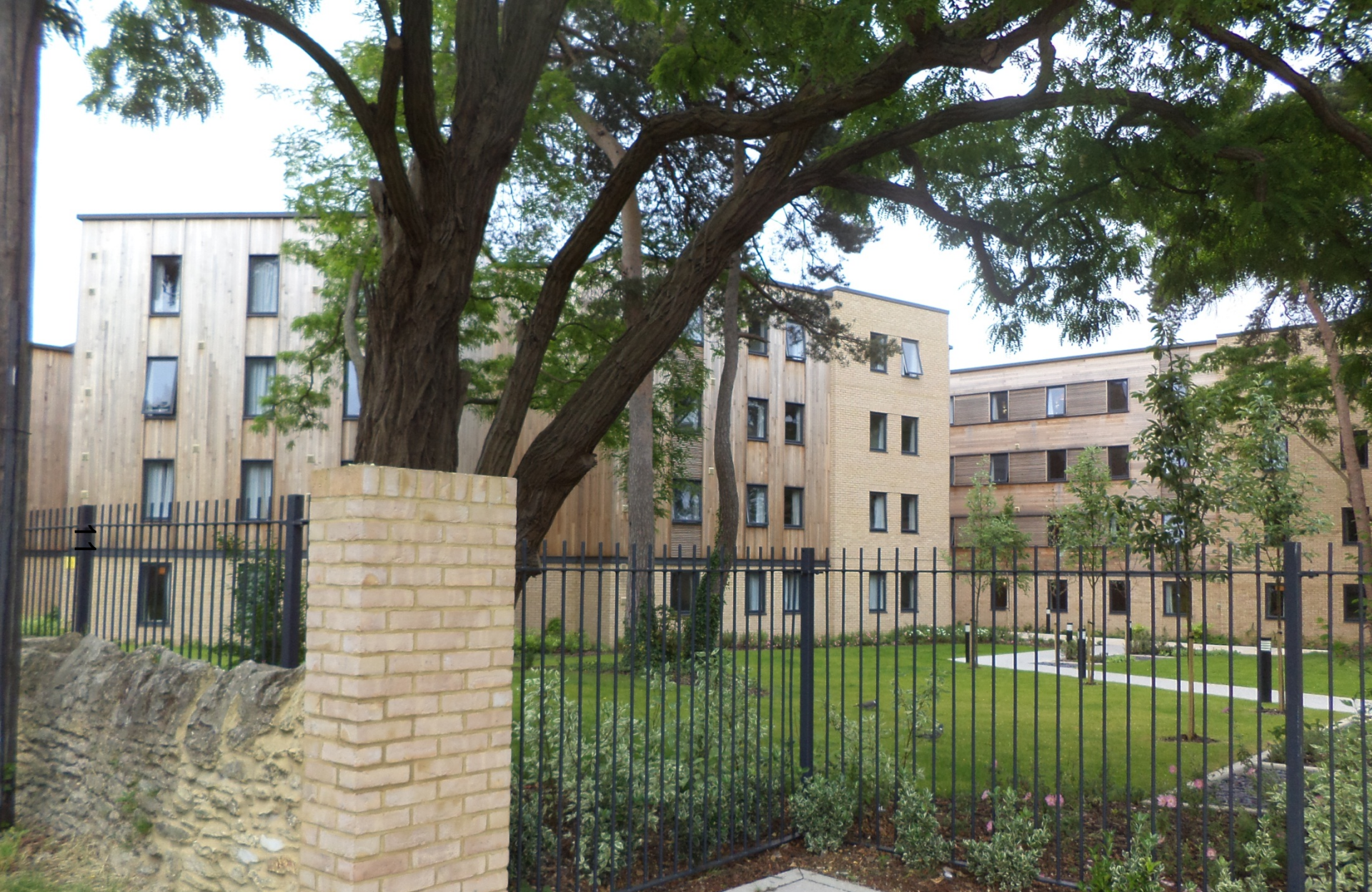
Front of Dorset House student accommodation from London Road