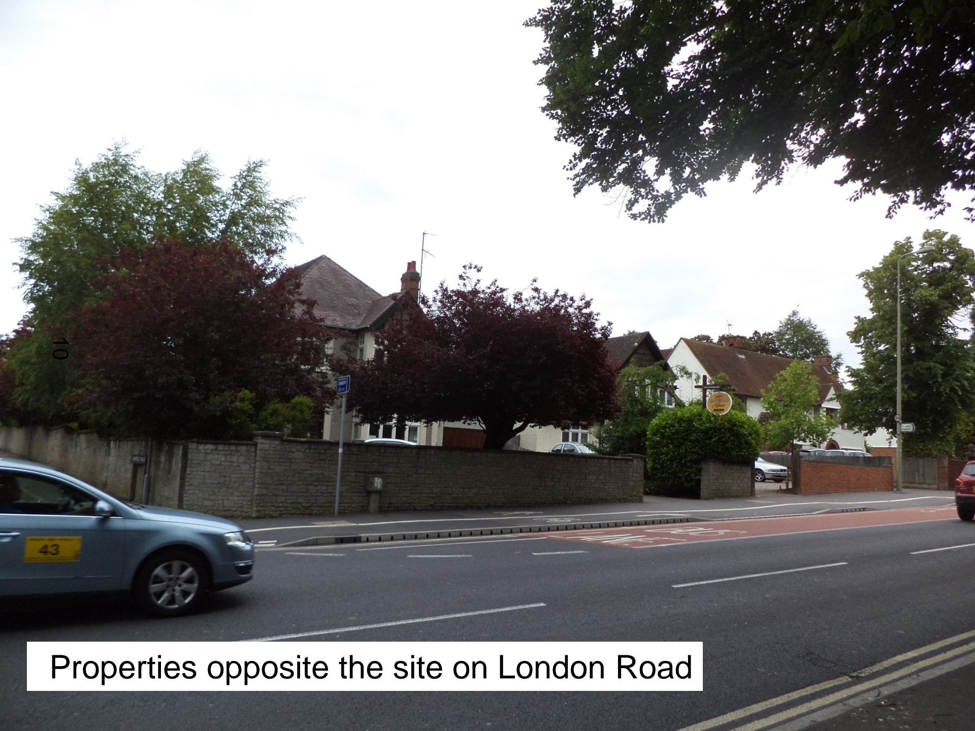
Properties opposite the site on London Road