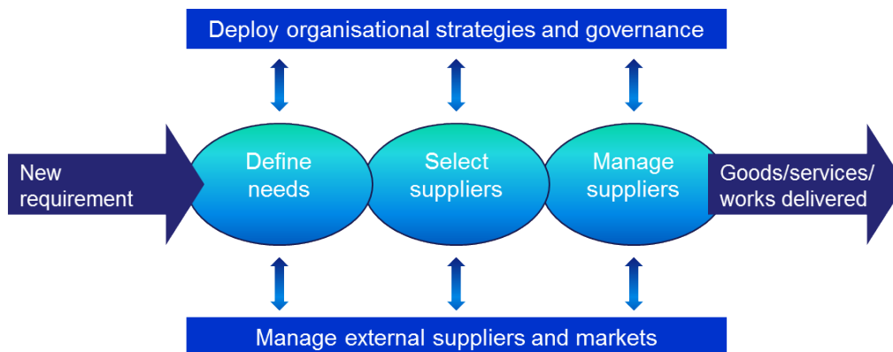
Diagram 1 – The procurement cycle

procurement includes the activities involved in establishing the fundamental requirements, sourcing activities such as market research and supplier evaluation, and the negotiation and management of contracts. It can also include the purchasing activities required to order and receive goods. Diagram 1 below shows the relationship of the key activities that influence/inform a procurement: