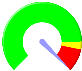
Planning and Regulatory

Budget: £696,092 Forecast: £896,092 Variance: £200,000