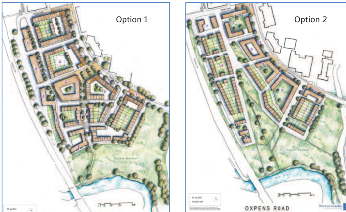
Option 1: Development boundary informed by flood mitigation scheme

3.7 Below are the two “Illustrative masterplans” showing how the two strategic options “could” look. Clearly the developable area of option 1 is more as this option would involve re-profiling of the flood storage area which is shown as a green swathe through the site in Option 2. Each of the options has positive as well as negative implications, not all of which will be caught through this SEA process. It is worth noting that these diagrams show the redevelopment after the potential final phase (as set out in the draft SPD) –in which the Ice Rink is no longer present on site. The section on Phasing in the SPD discusses this as the final element in the long-term redevelopment of the site.